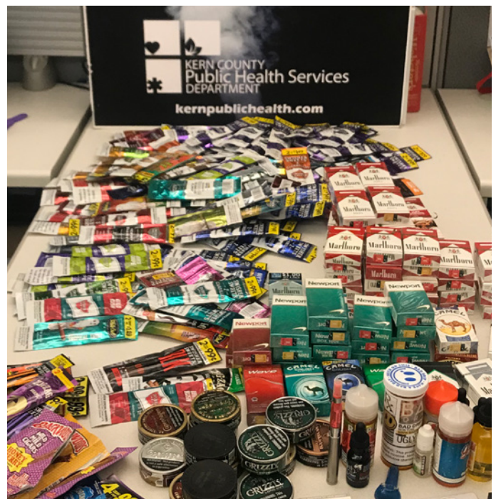
Tobacco products purchased by youth decoys through Kern County's tobacco retailers licensing program.

California law 1 requires that tobacco retailers obtain a state license to sell tobacco. However, local jurisdictions in the state have taken further precautions on the sale and distribution of tobacco products by implementing a local tobacco retailer licensing program. A tobacco retailer license (TRL) helps to ensure that tobacco retailers are compliant with local, state, and federal laws while addressing public health concerns in the tobacco retail environment such as the illegal sale of tobacco to minors. TRLs have helped local jurisdictions ensure that retailers are held accountable for violating tobacco control laws. Implementation and enforcement of a TRL can be especially challenging in rural communities where resources are limited. Nevertheless, communities such as Kern County have been able to adopt and